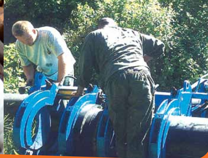
Industrial supplies and services