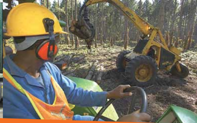
Forestry harvesting and siculture