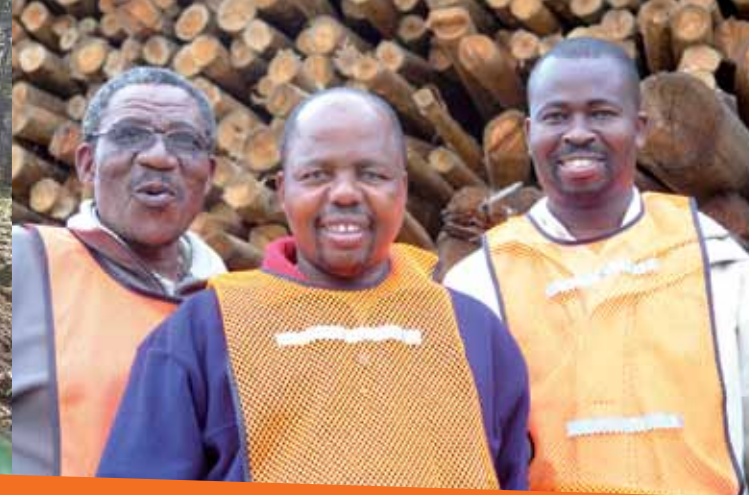
Timber procurement and logistics