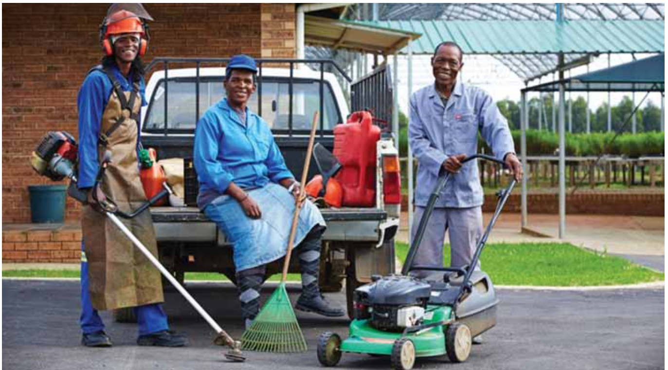
Hlalindela Gardening Service – a Mondi Zimele supported small business.