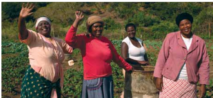
Community agriculture projects.

Mondi Zimele (MZ) has significantly upscaled its small business development activities with the establishment of a R140 million MZ Jobs Fund. The fund will be used to provide a range of small business support services and low interest loans to emerging small businesses operating within Mondi's value chain and beyond.